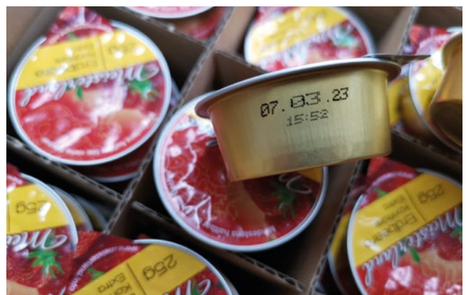
Best before date marking on jam tins