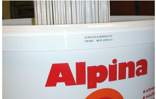
Marking of plastic paint buckets