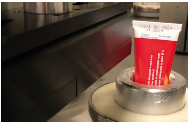
Expiration date on tube fold