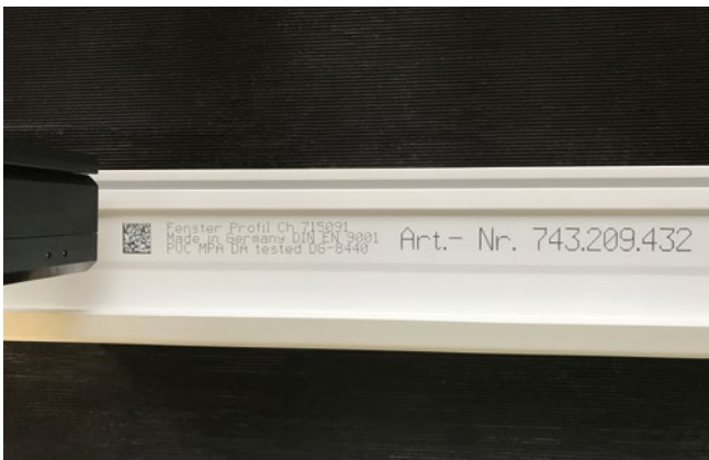
Coding and marking of plastic profiles