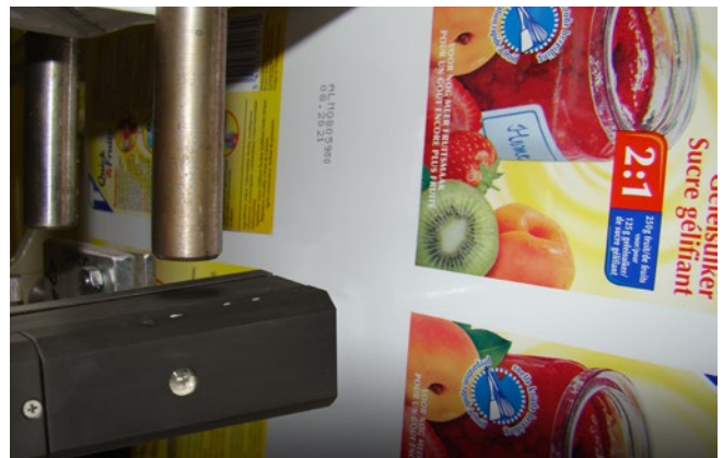
Marking of packaging foils