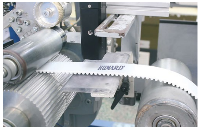
Marking of toothed belts